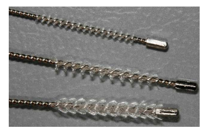
Figure 1 Different types of cytology brushes.

band imaging,<sup>2</sup> autofluorescence<sup>3</sup> or even magnification bronchoscopes.<sup>4</sup>