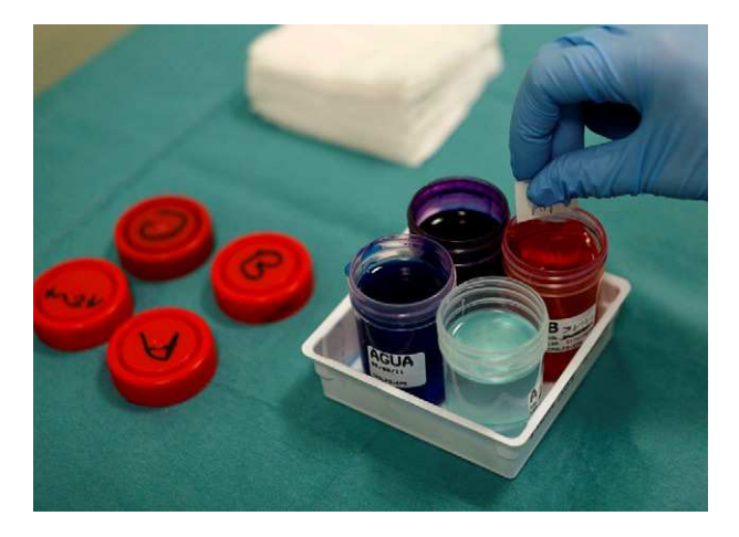
Figure 4 Reagents to quick stain.

Dooms et al. also recommend the use of conventional TBNA during the initial flexible bronchoscopy if enlarged