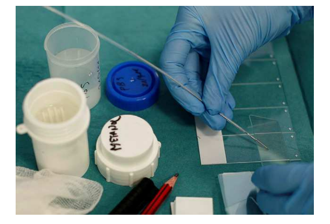
Figure 3 Transbronchial needle aspiration slide preparation.

To determine the number of aspirates need in a TBNA bronchoscopy Chin et al. studied the number of aspirates performed during flexible bronchoscopy in patients with known or suspected lung cancer and enlarged mediastinal lymph nodes. Their data indicate that a high yield occurs