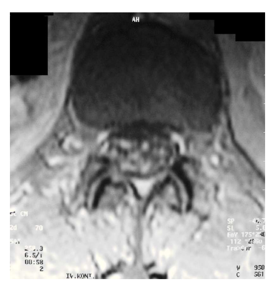
Fig. 2 – Transverse T1-weighted gadolinium-enhanced MRI scan at the L1-2 level. Enhancement of the cauda equina fibers in the thecal sac is seen

The tumor cells could reach the leptomeninges by several mechanisms: Arterial route (in patients with disseminated cancer, the leptomeninges are infiltrated through arachnoid vessels or choroid plexus); direct extension of the leptomeninges or seeding (primary CNS tumors), growing around and along peripheral nerves to the subarachnoid space (systemic tumors), iatrogenic (seeding of subarachnoid space during surgical extirpation of intraparenchymal metastases), entry to the subarachnoid space through the venous plexus of Batson and perivenous spread from adjacent bone marrow metastases. In most cases of breast or lung cancer pure leptomeningeal carcinomatosis is the result of cancer propagation from vertebral or paravertebral metastases<sup>1-4,9</sup>. New metastatic deposits along meningeal surfaces which invade subpial parenchyma, penetrate spinal nerve roots, and produce masses in the subarachnoid space.