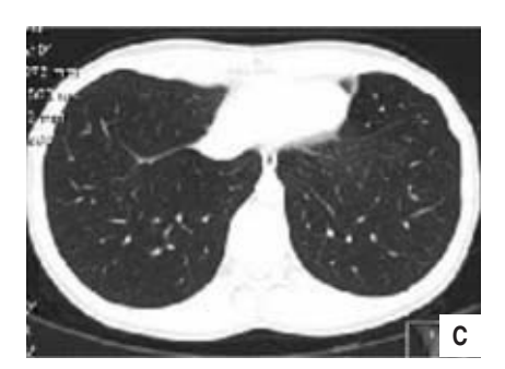
Fig. 2 – (A,B and C) High-resolution computed tomography of the chest