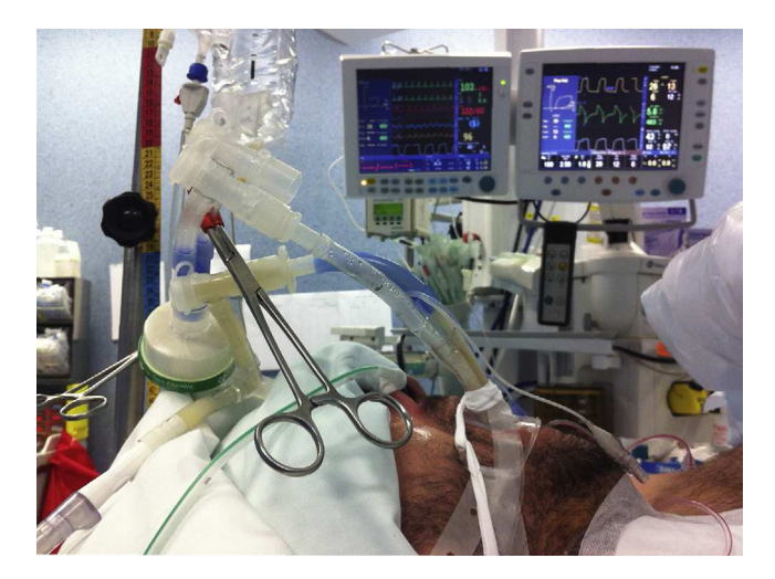
Figure 2 Technique representation of a WLL.

positioning to facilitate the gravitational instillation and removal of warm saline from the lungs.<sup>6,11</sup> This positioning was adopted when a bilateral WLL was performed (Fig. 2).