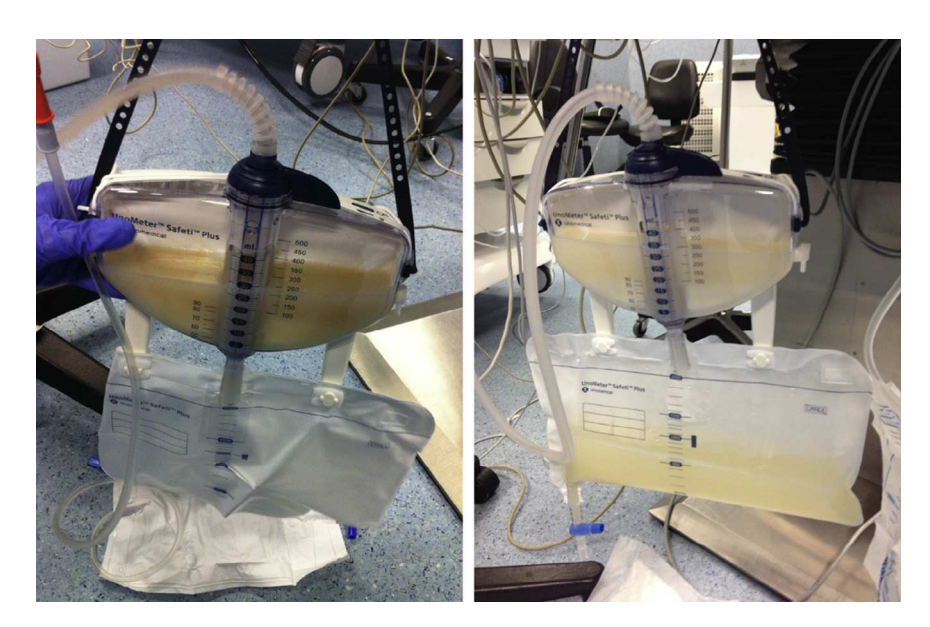
Figure 3 Evolution of the milky fluid through the procedure.

The second patient submitted to WLL was a female, 47 years old, farmer, non-smoker, no comorbidities, with the diagnosis of PAP one month before the first WLL based on