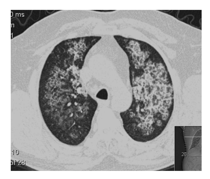
Figure 1 CT Scan of a patient with Pulmonary Alveolar Proteinosis. Note the thickened interlobar septa within the opacified parenchyma producing a ''crazy paving'' pattern.

Its efficacy has been attributed not only to the removal of lipoproteinaceous material from alveolar spaces, as well as the removal of anti GM-CSF antibodies, alveolar macrophages and type II epithelial cells. This therapeutic procedure is considered when a significant limitation in daily activities is reported by the patient and/or hypoxemia with