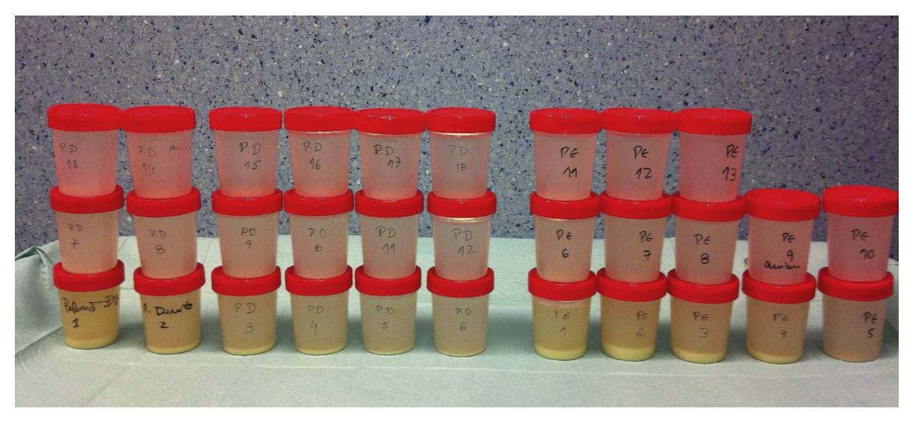
Figure 4 Sequential samples of bilateral WLLs.

In any case we observed an episode of contralateral lavage extravasation. In all procedures the body temperature was kept between 36 and 37 \,^{\circ} C. The mean procedure time was 8 h (range 7h32–9h41).