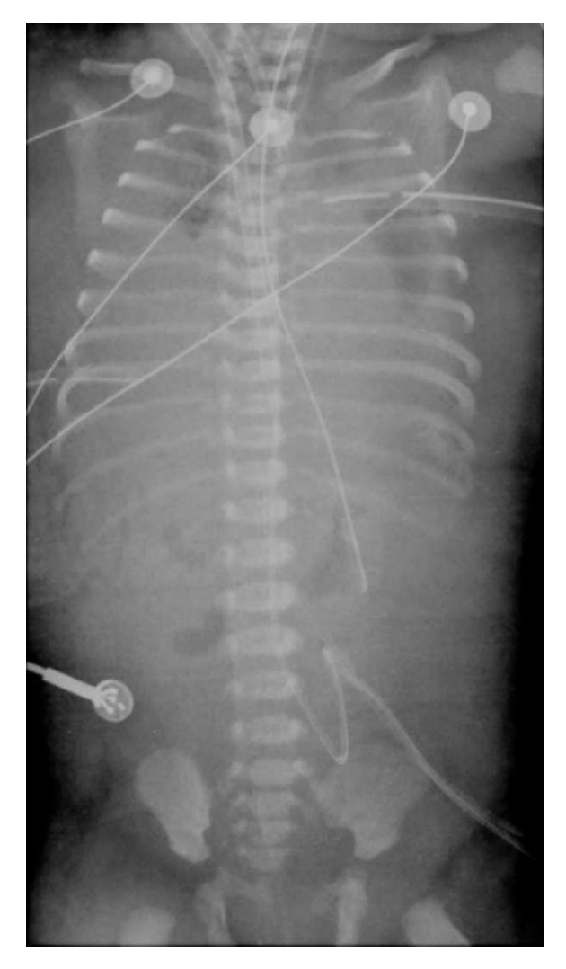
Figure 1 Case report 1. Chest X-ray of a 39 weeks gestational age girl on VA-ECMO: severe lung hypoplasia secondary to a bilateral congenital diaphragmatic hernia.

A right CDH with liver up was diagnosed at 31 weeks of gestation in a female fetus of a 23 years old, two gesta gravida. The echocardiogram 2D was normal, and no other anomalies