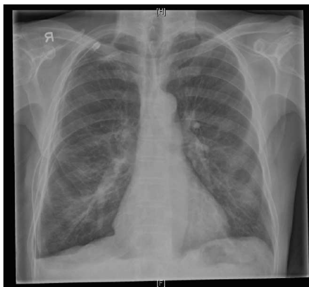
Figure 2 Small right side hydropneumothorax and a chest drain in place.

As a pleurectomy procedure had already been performed and an extra pleural pneumonectomy is not the norm in