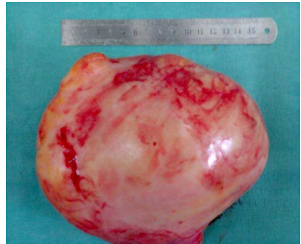
Figure 2 Gross appearance of the excised mass after removal from the chest.

On the basis of the patient's symptoms and the likelihood of resectability, we proceeded with a right thoractomy with single lung ventilation. A huge intrapleural mass measuring 18 cm × 12 cm × 10 cm and weighing 640 g was found attached to the inner surface of the chest wall by a 1 cm stalk. No other masses were found elsewhere. The mass was