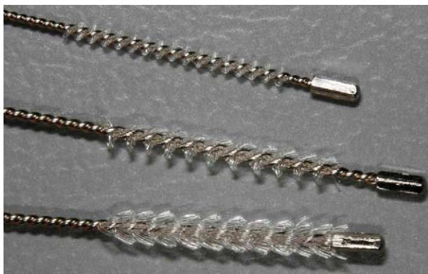
Figure 1 Different types of cytology brushes.

band imaging, 2 autofluorescence 3 or even magnification bronchoscopes. 4