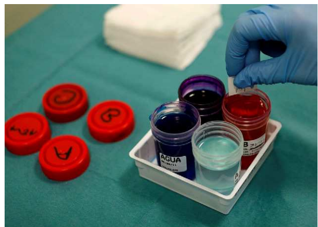
Figure 4 Reagents to quick stain.

Dooms et al. also recommend the use of conventional TBNA during the initial flexible bronchoscopy if enlarged