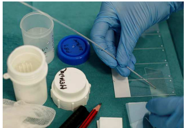
Figure 3 Transbronchial needle aspiration slide preparation.

To determine the number of aspirates need in a TBNA bronchoscopy Chin et al. studied the number of aspirates performed during flexible bronchoscopy in patients with known or suspected lung cancer and enlarged mediastinal lymph nodes. Their data indicate that a high yield occurs