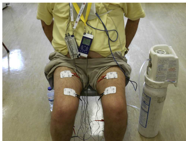
Figure 2 Neuromuscular electrical stimulation.

This is the case with interval training , which produces a high intensity peripheral muscle demand and at the same