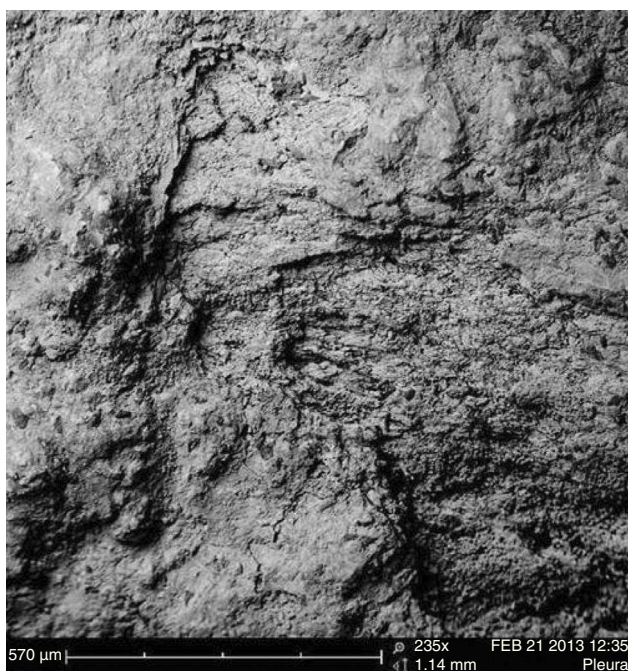
Figure 3 Scanning electronic microscopy of the pleural plaque surface (235 \times ).

Differences in surface roughness and orientation of the mineralizations on external and internal surfaces of the plaques