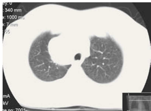
Fig. 3 – Thoracic computed tomography scan showing a paratracheal and pre-tracheal mediastinal mass, well-defined and with hydric content attenuation values

Sandra Saleiro, Adriana Magalhães, Conceição Souto Moura, Venceslau Hespanhol