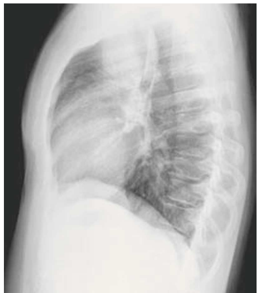
Figs. 1 and 2 – Chest radiograph showing a right-sided opacity in the anterior mediastinum

exam of his was inconclusive, revealing only mature B and T lymphocytes.