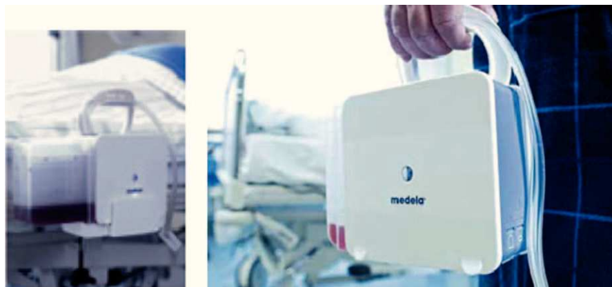
Figure 1 Thopaz Medela is a comfortable and safe device.

Fifteen days after hospital discharge and 20 after surgery, and with a gradual decrease of the air leak until it was less than 10 ml/min, and with clinical and chest x-ray evidence of pulmonary re-expansion, drainage was withdrawn.