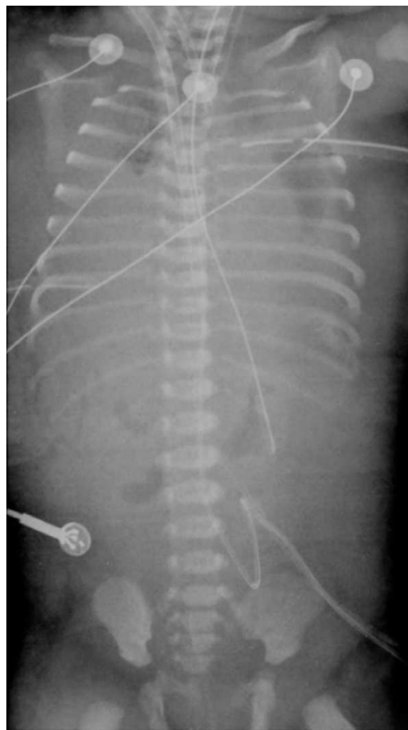
Figure 1 Case report 1. Chest X-ray of a 39 weeks gestational age girl on VA-ECMO: severe lung hypoplasia secondary to a bilateral congenital diaphragmatic hernia.

A right CDH with liver up was diagnosed at 31 weeks of gestation in a female fetus of a 23 years old, two gesta gravida. The echocardiogram 2D was normal, and no other anomalies