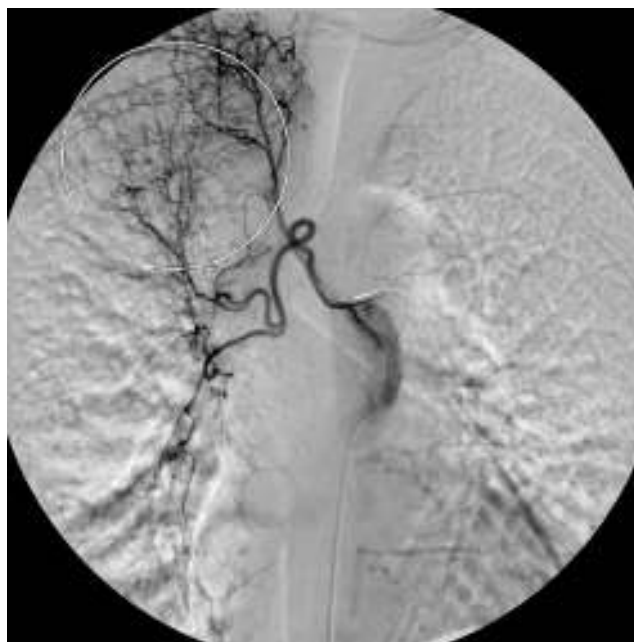
Figure 1 Selective catheterisation of the right intercostobronchial trunk. Circle: bronchial-to-pulmonary retrograde shunts in the right apex.

On the seventh day, a new episode of massive hemoptysis took place. On this occasion, the patient was hemodynamically unstable and the laboratory tests disclosed a hemoglobin of 7.3 g/dL. Two units of "packed" red blood cells and sufficient volume of crystalloid fluid were administered. The patient refused another bronchoscopy. Urgent bronchial arteriography was performed. Selective catheterisation of the right intercostobronchial trunk showed features of marked hypervascularization, including a tortuous and dilated right bronchial artery and bronchial-to-pulmonary retrograde shunts in the right apex (Fig. 1). Selective catheterisation of the left bronchial artery showed a bronchovascular fistula, where contrast leaked from the blood vessel drawing the left bronchial tree bronchography (Fig. 2, panel A), and a tortuous and dilated superior division