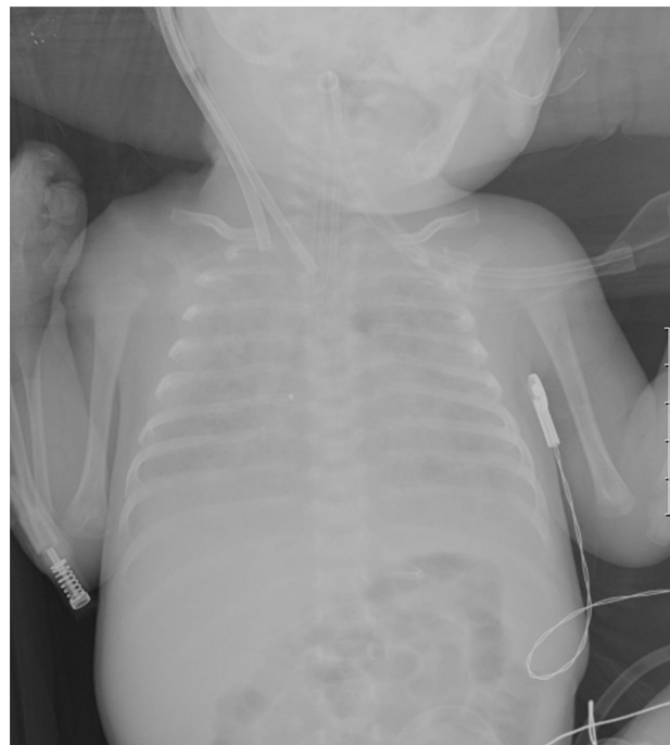
Figure 1 Chest radiograph. Persistent image of bilateral reticulogranular pattern after 2 weeks of ECMO.

After death lung and skin biopsies were performed, with written consent from the parents. The lung biopsy revealed chronic pneumonitis of the infant (Fig. 2).