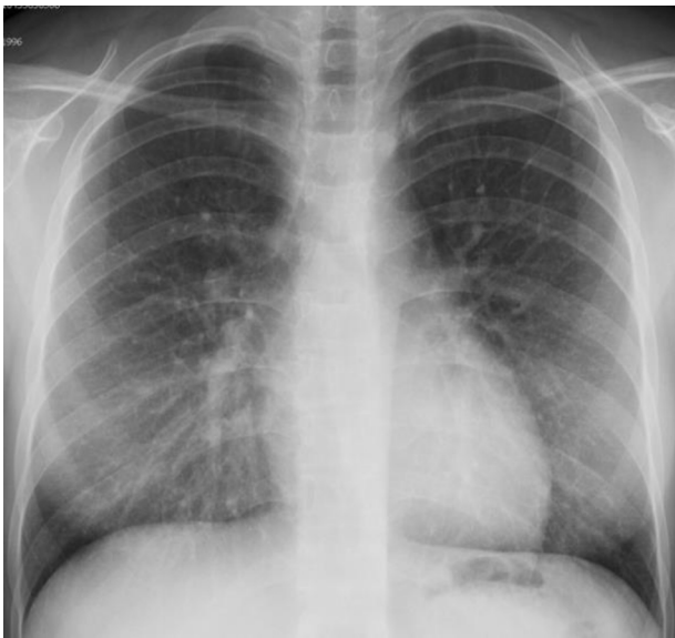
Figure 2 Chest radiograph illustrating reticular and fine micronodular opacities bilaterally.

Due to an age issue, her follow-up was transferred to the adult pulmonology department of the CHBV. Given the asymptomatic course maintained since 2011, she remained under immunomodulation with the antimalarial agent hydroxychloroquine.