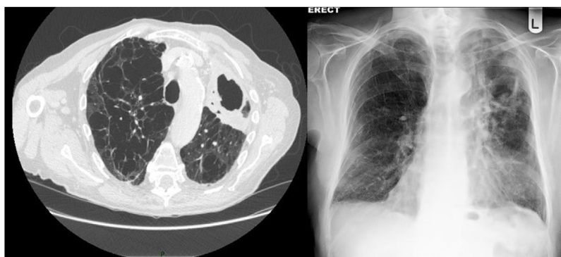
Figure 3 An example of cavitary non-tuberculous mycobacterial disease. The patient has COPD and severe emphysema is evident on the CT scan. In the left upper lobe there is a thick walled cavity. Sputum samples were persistently positive for M. avium .

is often described in textbooks and review articles as being to render the sputum negative by culture for NTM for 12 months which is important and the definition of microbiological response. Nevertheless, the initial discussion regarding whether to initiate treatment should take into account what the patient wishes to achieve with therapy, and not only a discussion of microbiological considerations. 85–87