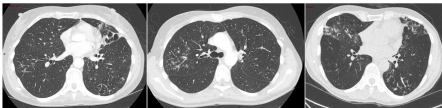
Figure 2 Nodular-bronchiectatic phenotypes of NTM. The CT images (left to right) show severe bronchiectasis in the Lingula in a patient with M. avium lung disease. Tree-in-bud is most easily visible in the right lung and the middle image shows this more clearly in the same patient. The right image shows a bilateral nodular bronchiectatic disease in a gentleman with M. abscessus infected.