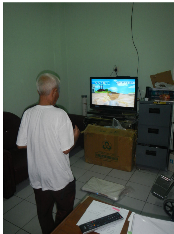
Figure 1 A patient training with the Wii Fit balance in the exercise room allowing only individual activities.

In this RCT, subjects 22 were assigned to two groups by block randomization: the experimental group (EG) received a hospital-based outpatient exercise training program and a Wii Fit videogame program; the control group (CG) received only the same hospital-based outpatient exercise training program. Researchers evaluating results and patients were