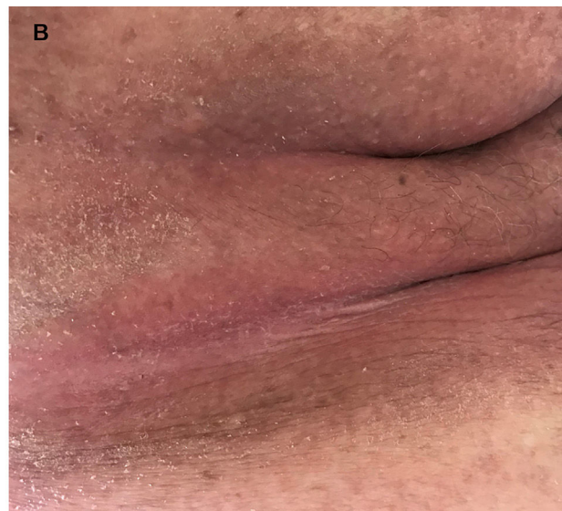
Figure 1 (A, B) — Osimertinib-induced skin lesions. Residual skin desquamation after acute dermatosis.