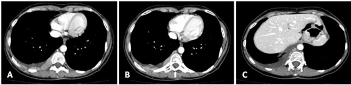
Fig. 1 (A-C). Chest CT scan showing macronodular pleural thickening in lower half of right hemithorax with contrast hyperenhancement, associated to moderate right pleural effusion.