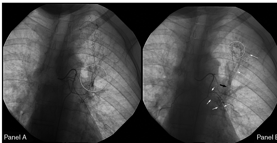
Figure 2 Left bronchial arteriography. Panel A. Circle: bronchovascular fistula. Panel B. Black arrow: Fistula formation between a vessel and the tracheobronchial tree. White arrows: contrast leakage from the vessel drawing the bronchial tree bronchography. Circle: tortuous and dilated superior division of left bronchial artery.

to cause massive hemoptysis and many clinicians believe that other contributing factors must be present for massive hemoptysis to occur in the setting of bronchitis alone. 2 Menchini et al. have reported a retrospective cohort of 35 patients with smoking-related bronchopulmonary disease and no associated comorbidity, who were referred for embolization to cease hemoptysis. Bronchial artery angiography revealed moderate or severe hypervascularization in 28 (80%) patients and no statistically difference was observed between the angiographic findings and the severity of COPD, tobacco consumption or the amount of bleeding. 10 He then suspected of the Dieulafoy's disease in these cases. Therefore, recurrent and massive hemoptysis caused by hypervascularization within the bronchial wall due to chronic airway inflammation in the context of a smoking history might be explained by an acquired form of this entity.