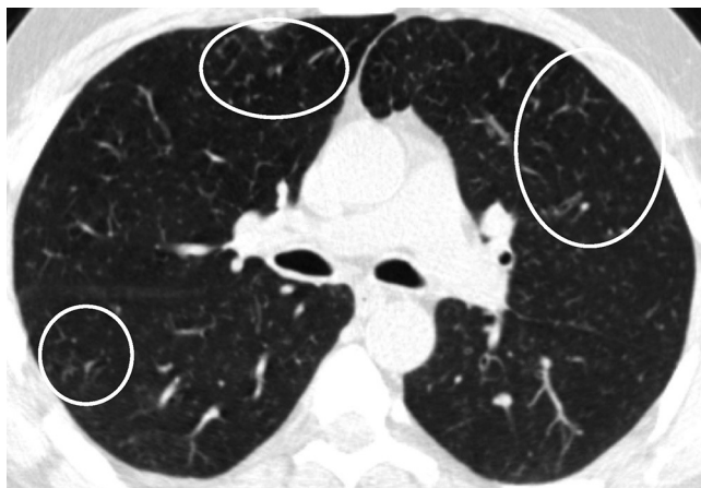
Figure 1a Axial CT image at lung window setting showing centrilobular ground-glass nodules (circles).