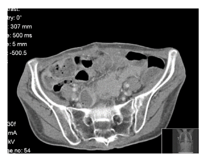
Figure 1 Abdominal CT: thickening of the wall of the ascendant colon, with abnormal contrast accumulation.

Other infectious foci were excluded, namely lungs and heart. Abdominal fluid lavage, performed during surgery, blood cultures, coprocultures and Cytomegalovirus antigenemia were also negative. Six weeks later she did a control colonoscopy which showed no lesions. The patient suspended fungal therapy after 12 weeks and maintains regular follow up without intestinal complaints since treatment (5 years).