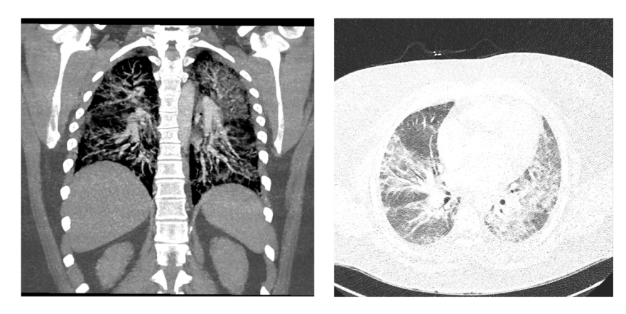
Figure 1 Chest CT scan on presentation showing bilateral infiltrates. Left: coronal view; right: axial view.