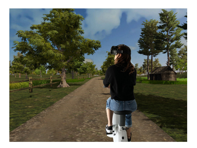
Figure 1 An example of a Virtual Reality-based system for physical endurance training.