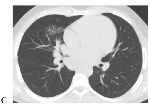
Fig. 1 (Original images) (A) Chest x-ray with right mediastinal enlargement. (B-C) Chest computed tomography, depicting an infracarinal mediastinal mass and a right middle lobe consolidation. (Original images).

(NE) markers (CD56) was positive, highlighting an unusual finding and the nonspecific character of NE marker expression, underlining the need to maintain a broad differential diagnosis when approaching high-